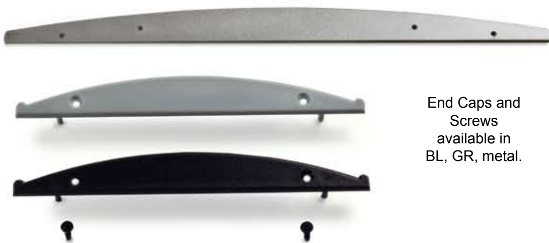
End Caps and Screws available in BL, GR, metal.