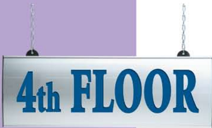
Hanging Ceiling Sign